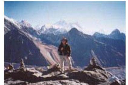
18,000 ft. in Nepal with Mt. Everest in the background